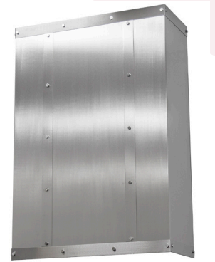
Brushed Stainless with Modern Accents