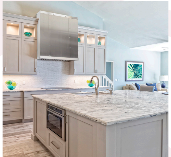
ST1100 range hood