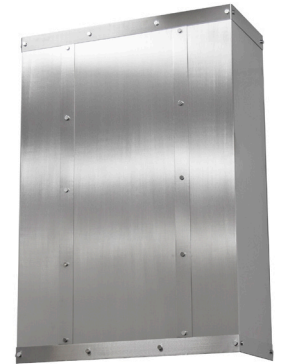
Brushed Stainless with Modern Accents